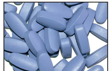
Sex Drugs for Sex Offenders: $2,013