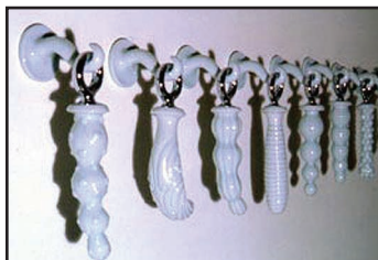
Dildos on Hooks: $5,000