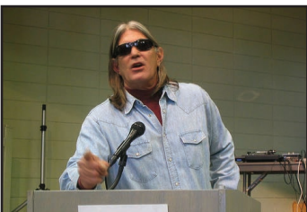
Ward Churchill: $70,000 2