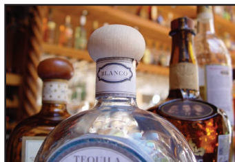
Booze for CU: $508,000